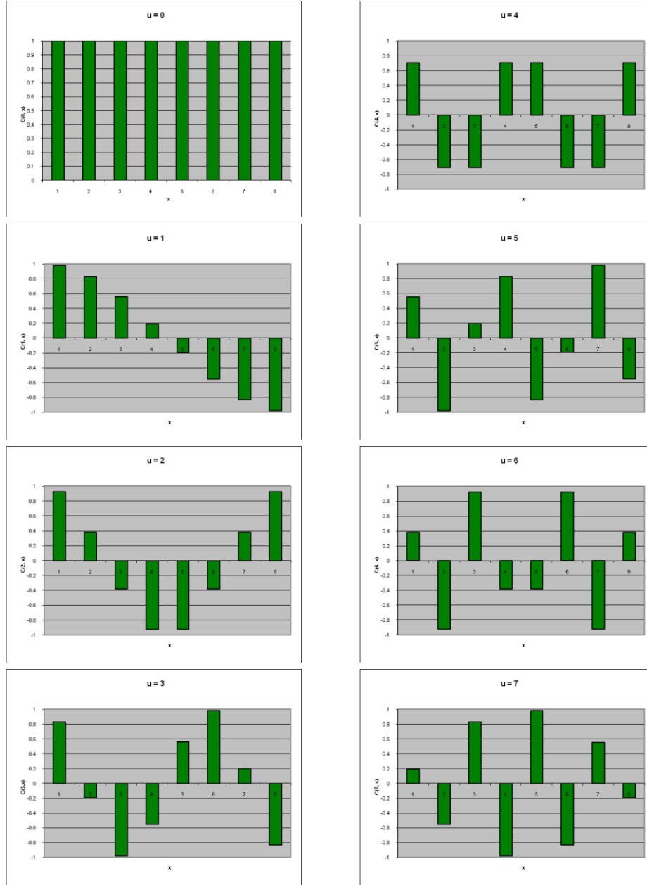
Figure 2. 1D basis functions for N=8 .

The two-dimensional DCT for a sample of size N \times N is defined as follows: