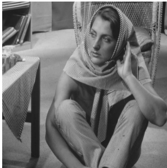
Figure 1. “Barbara” test image.

GPU acceleration of DCT8x8 computation has been possible since appearance of shader languages. Nevertheless, this required a specific setup to utilize common graphics API such as OpenGL or Direct3D. CUDA, on the other hand, provides a natural extension of C language that allows a transparent implementation of GPU accelerated algorithms. Also, DCT8x8 greatly benefits from CUDA-specific features, such as shared memory and explicit synchronization points.