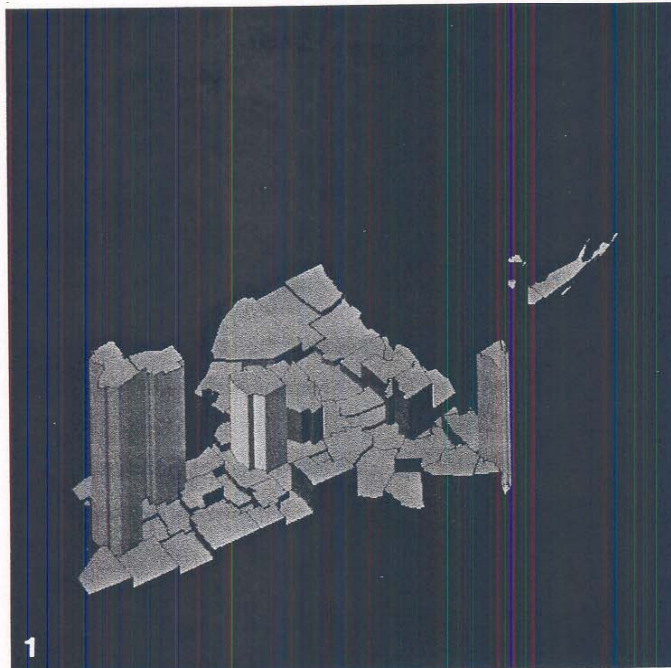
Fig. 1. Number of licensed drivers per county of New York State in 1980.