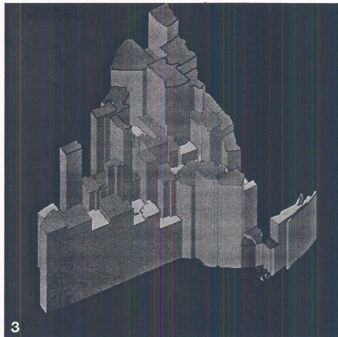
Fig. 3. Ratio of convictions to drivers by county of New York State in 1980.