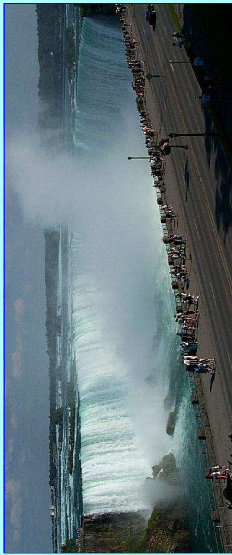
Actual Niagara Falls