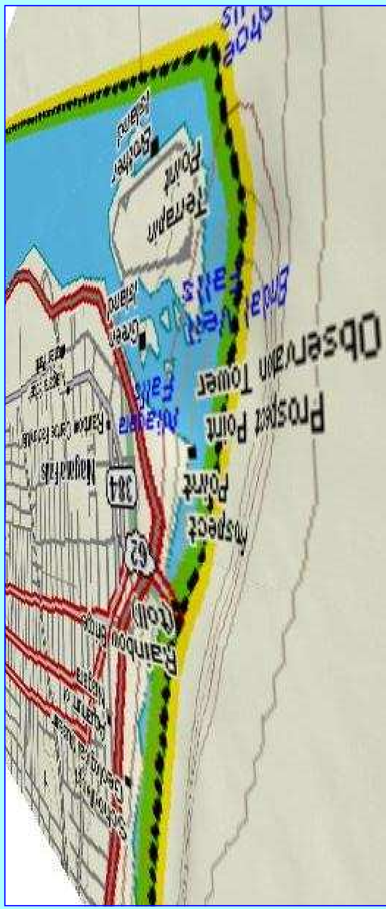
Rendered Niagara Falls